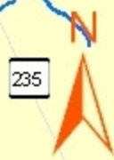
Fairborn Park Facilities Map 2007